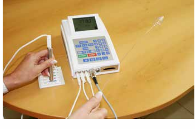
Self-test with protection detector

If you perform the test on another person, make sure to touch the insulated part of the protection detector. Hold the protection detector in your left hand, the Rayotensor in your right hand.